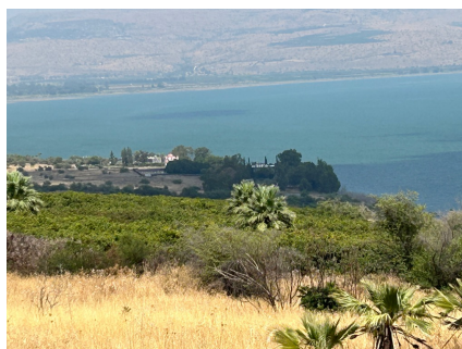
Capernaum and the Sea

From June 29-July 12, TIBI hosted its 9th trip to Israel. The first two and a half days were unprecedented in our experience, as our flights were cancelled, and we were unable to get to Amman till 60 hours later. The airlines also lost the luggage of most of the group, and we didn't get it back till we returned home.