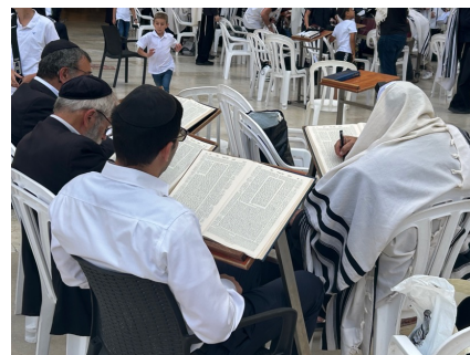
Orthodox Jews studying at the Wall

When we finally got on the bus in Amman, we went straight to Petra, then on to the southern border of Jordan, crossed over the Israel, and arrived at the Dead Sea that night—also dead on our feet from most of three days in airports, layovers, and sleepless nights.