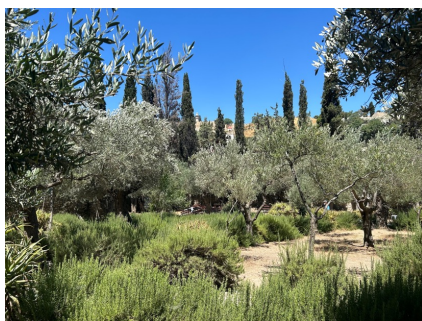
Tranquil Garden of Gethsemane