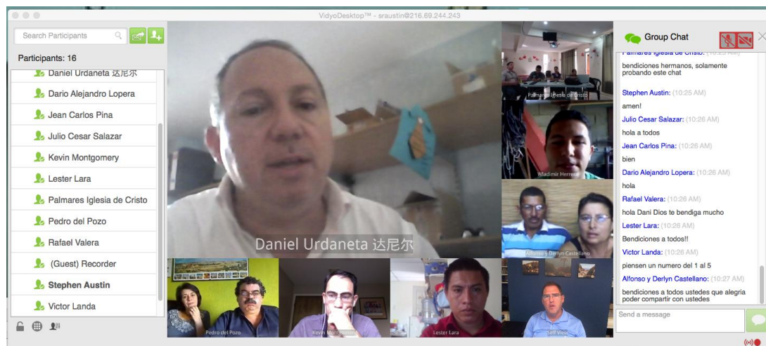
Orientation with some of the new students from August 2015

At TIBI, we're in the middle of our scholarship selection process. This year 45 candidates from 9 different countries applied to study. We would love to be able to grant all of them scholarships to study full-time. Depending on the economic conditions of the various countries, our scholarships range from $100/month to $600/month. So we may only be able to give eight to twelve scholarships this year.