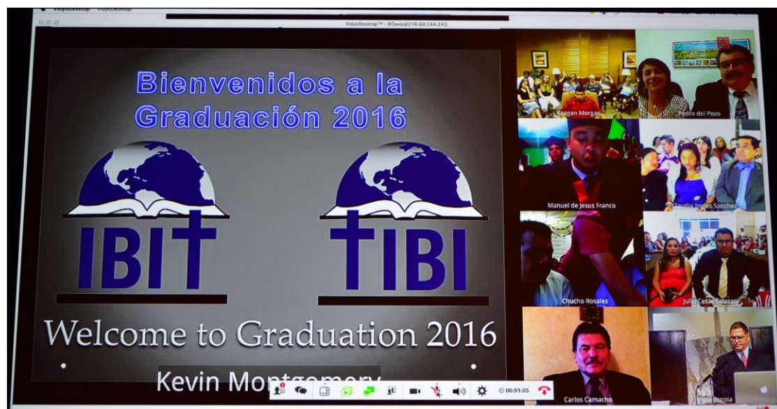
Screen shot during graduation service at Southeast Church of Christ, July 23

On Saturday, July 23, at the Southeast Church of Christ in Houston, TX, TIBI celebrated its 10th graduation, and enjoyed the presence of more than 180 people in 8 sites, including many by video conferencing.