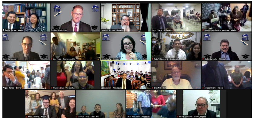
Graduation, with students, families, and church members

On Saturday, July 24, TIBI celebrated its 16th graduation ceremony. For the second year in a row, it was mostly a Spanish service, and also a virtual one. In all, 8 different nations were represented among the 11 graduates that night.