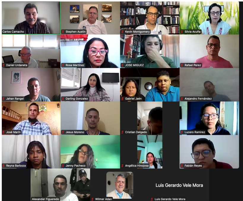
Screen shot from 2024 orientation

They have worked hard so far this year and shown intelligence and perseverance in courses like Hebrew and Greek! We ask for your prayers for their academic, spiritual, and ministerial growth as they continue their work with us. And please pray for the next group of scholarship candidates, who even now are in the process of evaluation and selection for the 2025-26 cohort.